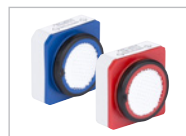
Easy to service