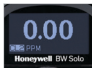
Easy to read