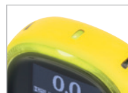
Easy to see