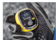
Easy to handle